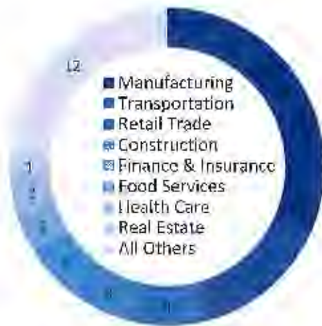
Leads by City

46,000-square-foot, specialty care center will be located just off Highway 99 and Merced Avenue and will open in late 2018. Once complete, the specialty care center will encompass pediatric sub-specialists in cardiology, endocrinology, gastroenterology, neurology and maternal fetal medical specialists. This state-of-the-art facility is slated to bring 55 new jobs to the greater Fowler community. There are also plans for a 4.5-acre community park that will house medical supportive services. In conjunction with the City of Fowler and through the 5 Cities JPA, the EDC is proud to have worked on this project for the past two years.