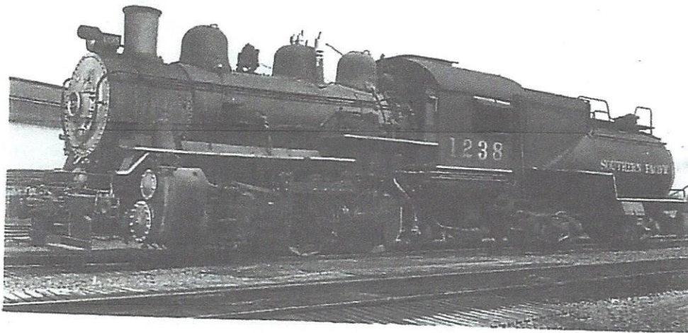
Southern Pacific #1238

Since that time the Historic Kingsburg Depot has become a popular historic and educational destination for the general public and for schools in four counties of Central California. In June 2017 Friends was awarded a Union Pacific Community Ties grant of $10,000 to develop a curriculum to meet California State standards for 3 rd , 4 th , and 5 th grade studies, and that curriculum has been in use at the Depot ever since.