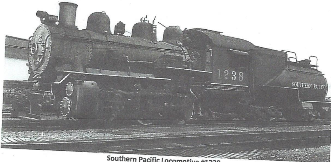
Southern Pacific Locomotive #1238

Friends of the Historic Kingsburg Depot, Inc. June 4, 2024