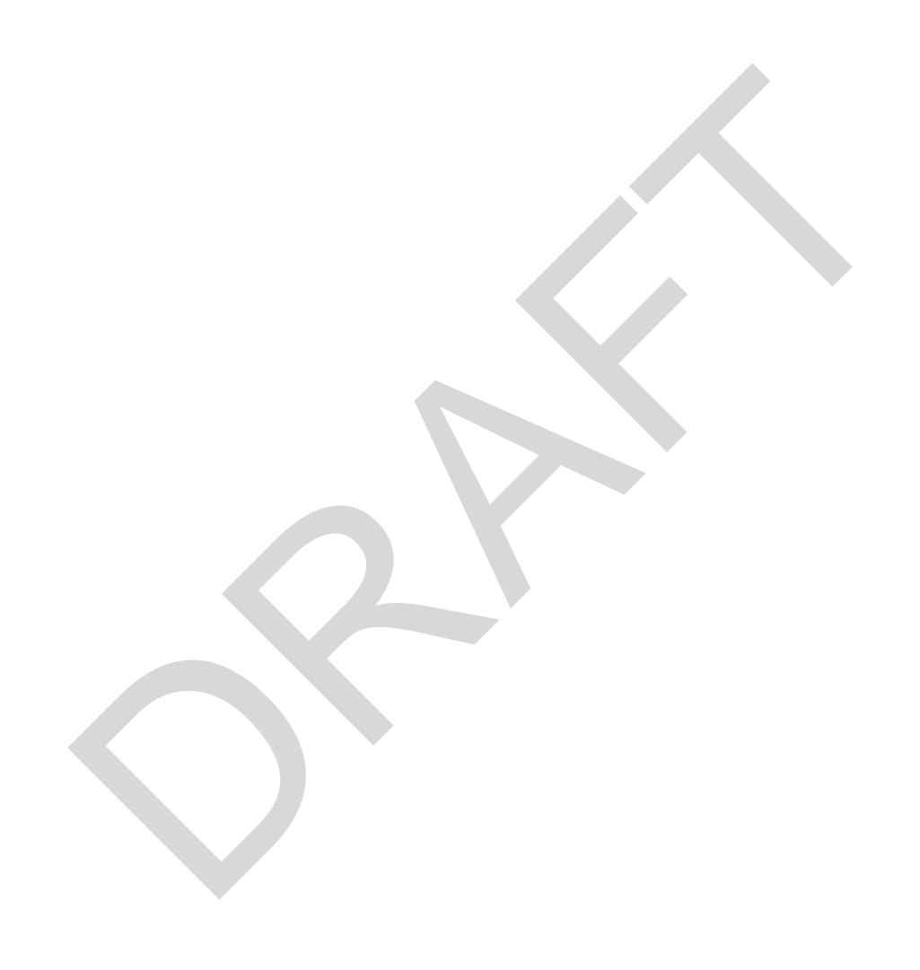
Exhibit E - Special Conditions

The Arthur at Blackstone, LP, Housing Authority of the City of Fresno and County of Fresno 20-NPLH-14603 Page 2